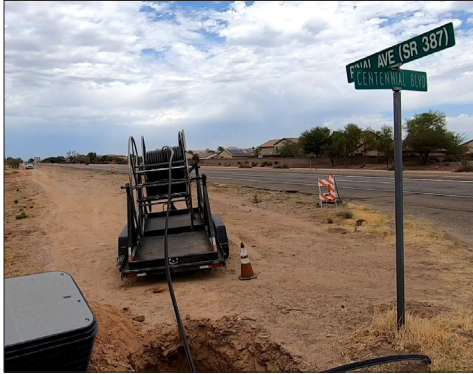
Conduit being laid on Pinal Ave and Centennial Blvd.

Our construction crew continues to work along Pinal Ave. where we are currently installing 4-way micro duct to house our current fiber and remain prepared for Casa Grande's future fiber capacity needs.